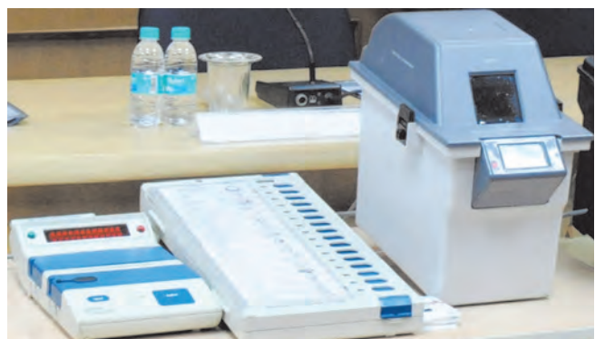
Figure 10.4: Electronic Voting Machine