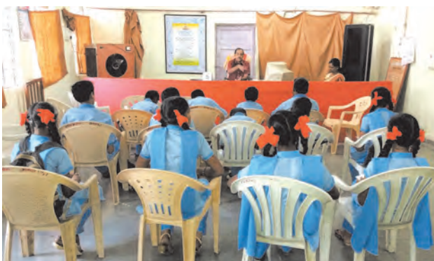
Figure 10.1: Visit to the election office

Prepare a plan for a fieldtrip of your class to a place of special interest/visit to an office and prepare a questionnaire.